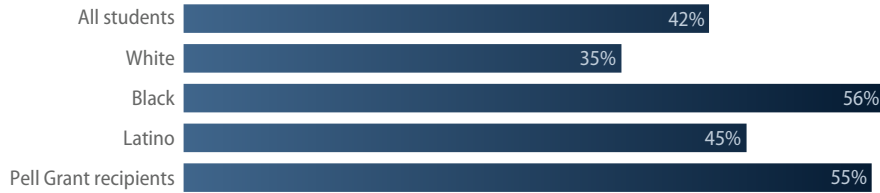
FIGURE 2 National rates of remedial education enrollment by student groups

Note: Pell Grants are awarded based on demonstrated financial need. Source: Complete College America, "Spanning the Divide," available at http://completecollege.org/spanningthedivide/#far-too-many-students-start-in-remediation (last accessed July 2016).